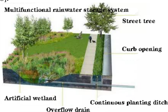
Figure 4 Underground storage tank rainwater storage system explanatory diagram.

(1) Design of underground reservoirs based on the concept of sponge city. In the process of collecting the rainwater pool, it generally consists of eight parts, including the pool body, the sediment well, the water well, the high and low ventilation caps, the inlet and outlet water pipes, the aeration system and the overflow pipe. The treatment of aquifers should be differentiated according to the choice of plants [8].