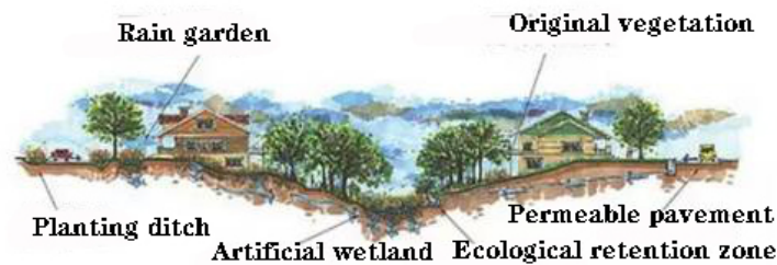
Figure 5 Rainwater garden design before and after comparison.

(3) Sinking green space has also been applied in the landscaping of some cities, and the effect is also remarkable. This kind of green space is to increase the storage volume by sinking the green space, and achieve the purpose of water storage and water purification. Generally, it is constructed into a wet pond, a wetland, and a biological detention facility [6].