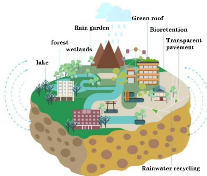
Figure 3 Sponge City Diagram.

The research shows that the technical standards of the sponge city are not uniform, and the measures are numerous, which is not conducive to the spread and popularization. Therefore, in this paper, we classify the rainwater in the sponge city into three categories. The permeable concrete involved in the above is used to collect rainwater. The “water collection measures” are used for “water storage measures” to store, store and filter rainwater, and “water use measures” for effective use of rainwater [1]. The water storage measures for the sponge city will be explained below.